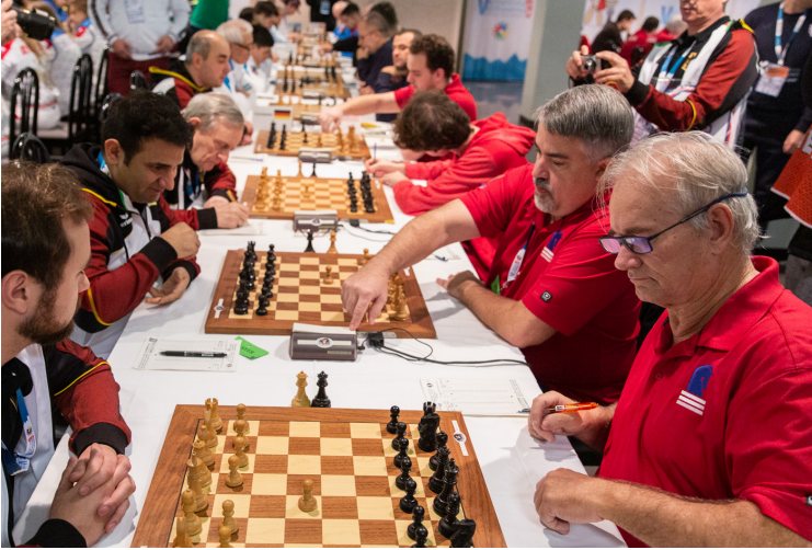
(The USA Deaf Chess Team plays against Germany on Friday, Dec. 19, 2019 in Chiavenna, Italy.)