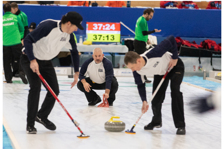
USA Deaf Curling plays against Hungary during the 19th Winter Deaflympics on Wednesday Dec 18, 2019 in Madesimo, Italy.