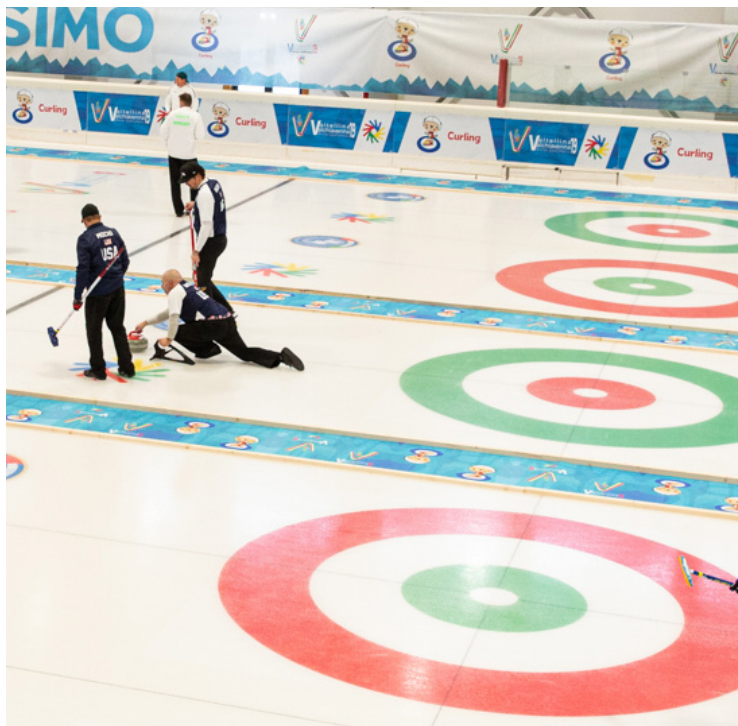
The Curling venue heats up with competition among 12 teams on December 13, 2019 at the 19th Winter Deaflympics in Madesimo, Italy.

The 6-4 win gives USA its third straight win. With a 3-2 record, USA looks forward to a 9AM matchup against Finland today before taking on the mighty Russians at 7PM.